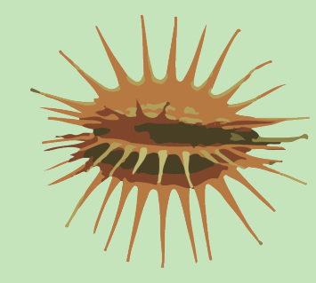
What might grow from these seeds?