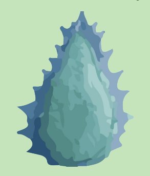
What do they look like to you?

Artist Rob Kesseler uses an electron microscope to take close up photographs of seeds.